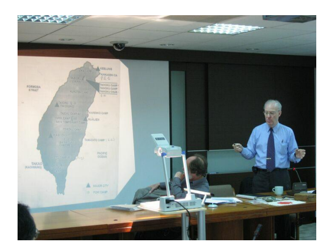
Sharing the POWs' story at Academia Sinica, Taipei

The Taiwan POW Memorial - a monument to brave and gallant men