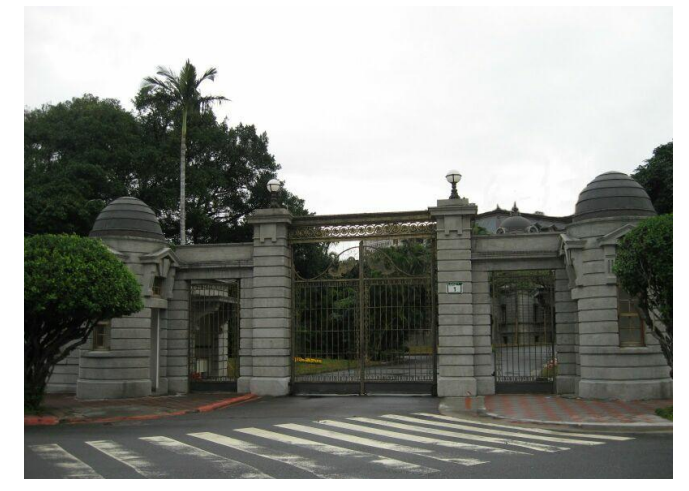
Front Gate of the Taipei Presidential Guest House

see if anything remained of those former times. This past October I put my request to the Protocol Section of the Ministry of Foreign Affairs and after some arranging permission was granted for a visit on January 14<sup>th</sup> this year.