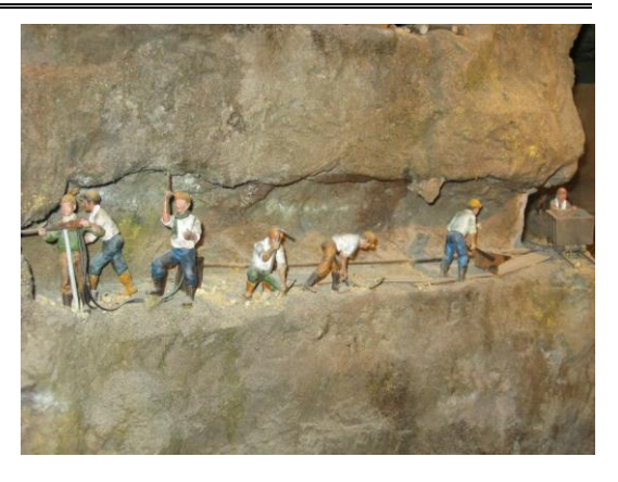
Men working down the mine... suffering... - diorama at the Jinguashi Mine Museum