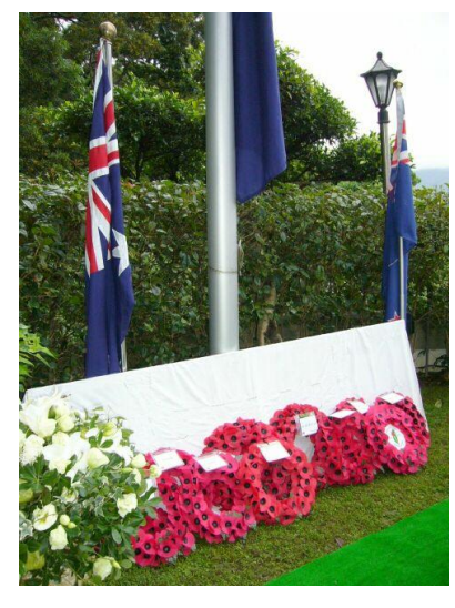
ANZAC Day - Remembering POW cousins lost at sea